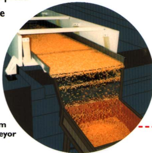
Transfer of Product from Vibratory Feeder/Conveyor into Bucket Elevator