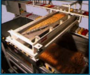
▲ TRAVELING SPREADER