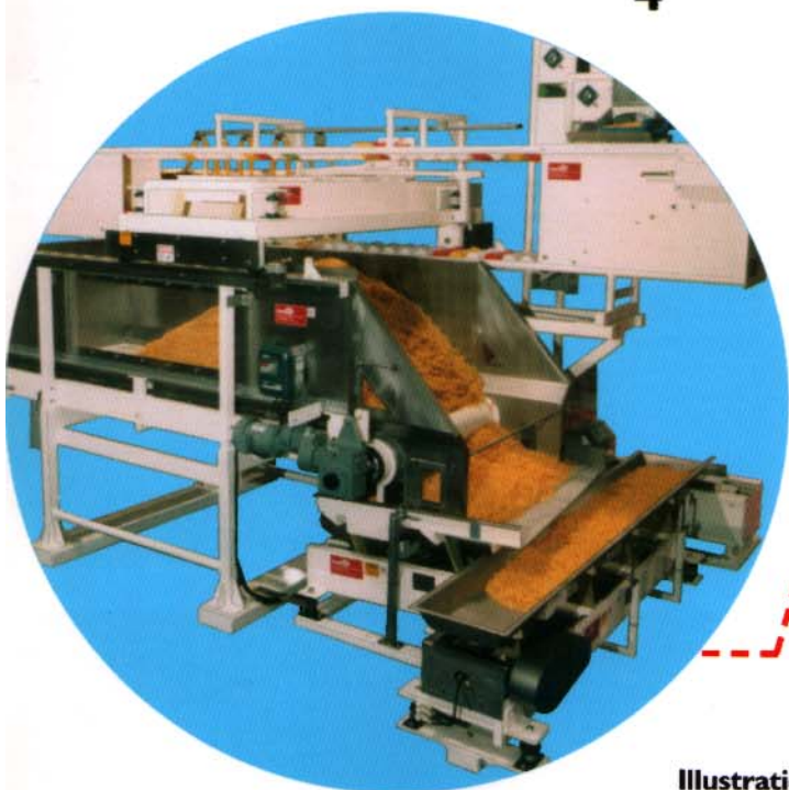
Transfer of Product from Store-A-Veyor onto Discharge Vibra Conveyor