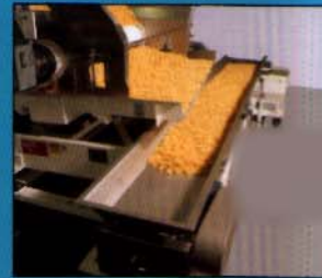
▲ TO PACKAGING