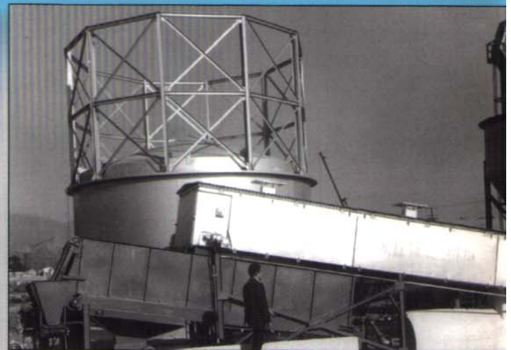
DEAMCO Product Dehydrating Process and Store-A-Veyor System

DEAMCO provides maintenance services throughout the life of your system. Using the latest data-retrieval system, we can dispatch service assistance from our offices in the U.S. or abroad. DEAMCO's technical field supervisor assists you in installing your system, starting it up; and training your personnel to operate it and perform on-site maintenance.